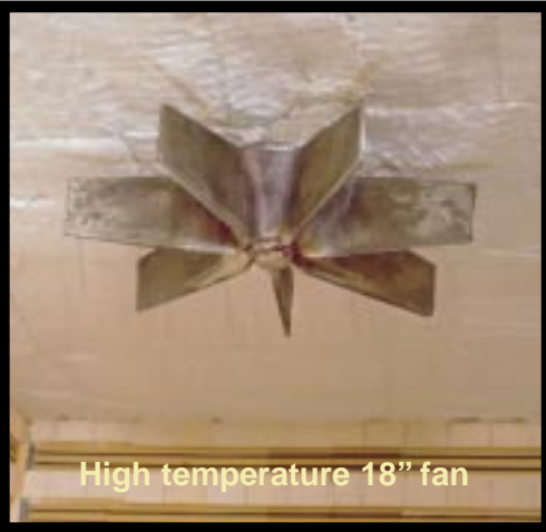
High temperature 18" fan