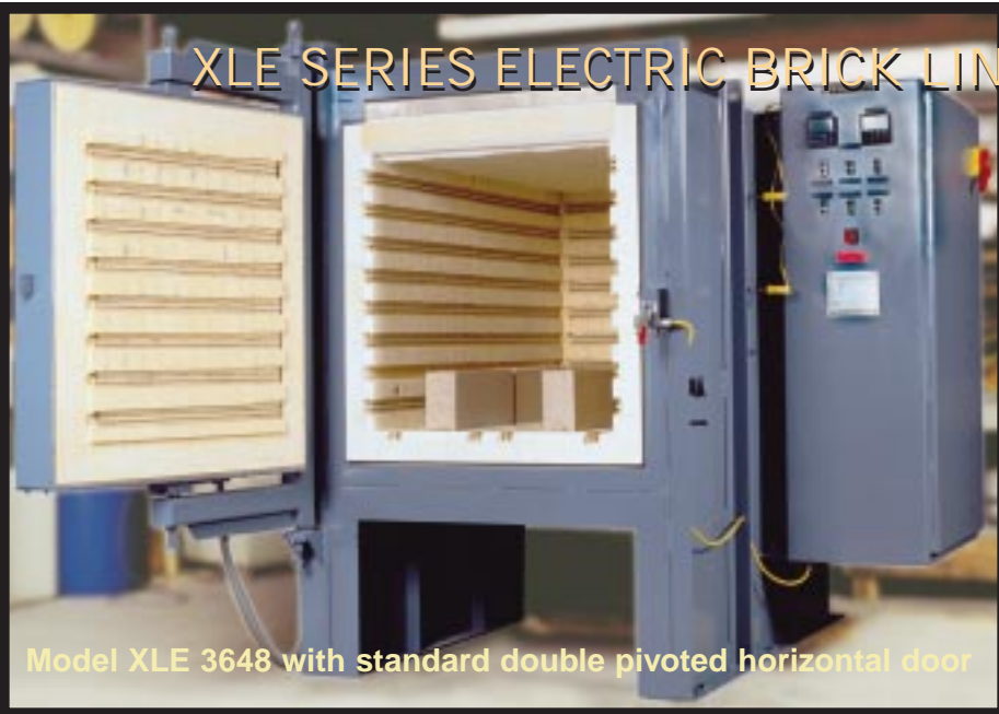
Model XLE 3648 with standard double pivoted horizontal door